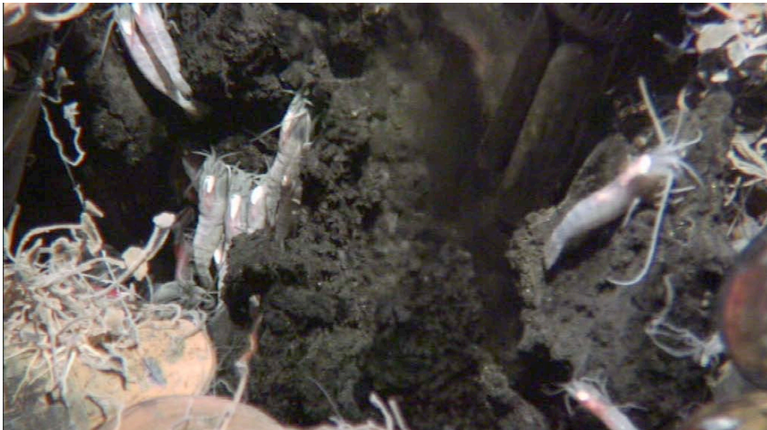
Fig. 3: Vent shrimp ( Rimicaris exoculata and Chorocaris chacei ) near vent fluids as hot as 110°C. The nozzle (held by the ROV arm) is taking up fluids for online analyses of methane, hydrogen, sulfide, oxygen and other gases using the in situ mass spectrometer.

ready to bring the ROV back to the ship, the wind had become stronger again, and the relatively high waves together with the added weight of the heavy OBT made the recovery of our ROV quite a challenge!