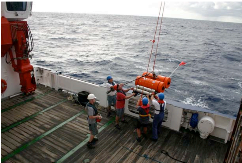
Fig. 2: Recovery of an OBS

We spent February 2 nd recovering Ocean Bottom Seismometers (OBS) that were